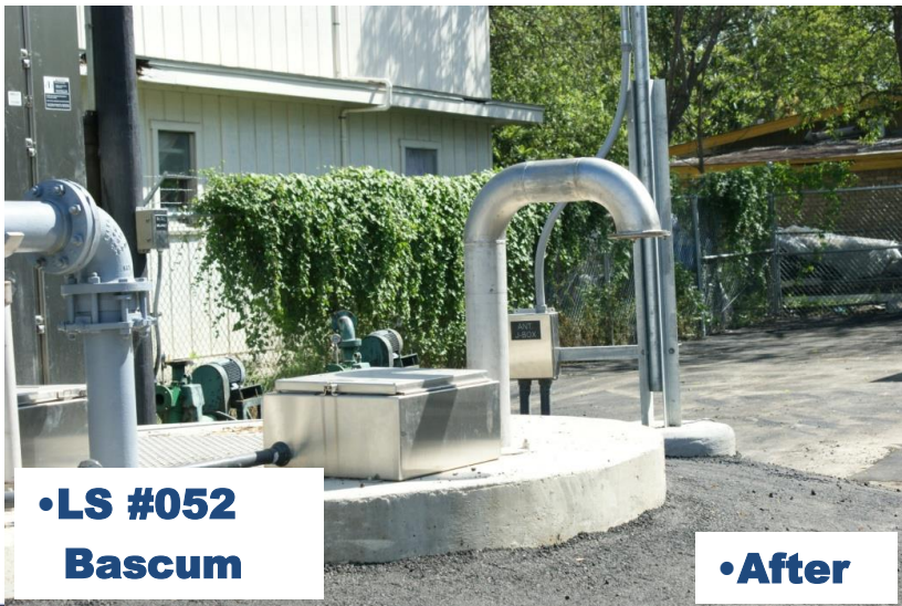
•LS #052 Bascum