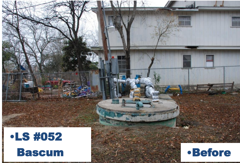
•LS #052 Bascum