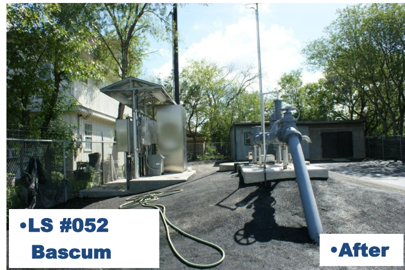
•LS #052 Bascum